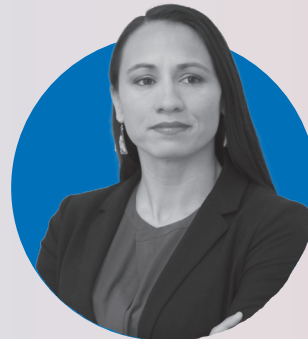
SHARICE DAVIDS KS-03 INCUMBENT REP. (D)

“Decisions about abortion should be made in Kansas, not in Washington.”