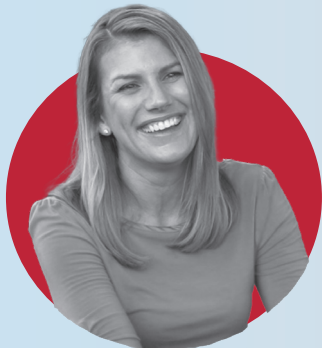
AMANDA ADKINS KS-03 REP. CANDIDATE (R)

“Kansas needs a new governor who will make daily life more affordable during this time of record high gas prices, soaring grocery bills and a lagging state economy.”