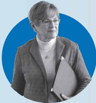
LAURA KELLY INCUMBENT GOVERNER (D)