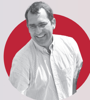
DEREK SCHMIDT GOVERNER CANDIDATE (R)

“In just four years, we’ve put Kansas back on track, built an award-winning stable economy and broke records for new business investment.”